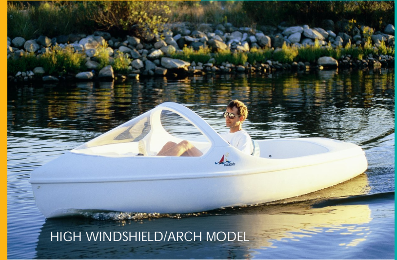
HIGH WINDSHIELD/ARCH MODEL